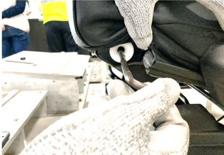
Fig. 3 Torsion Bar Location