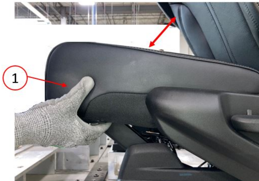
Fig. 2 Seat Back at 45 Degree Angle