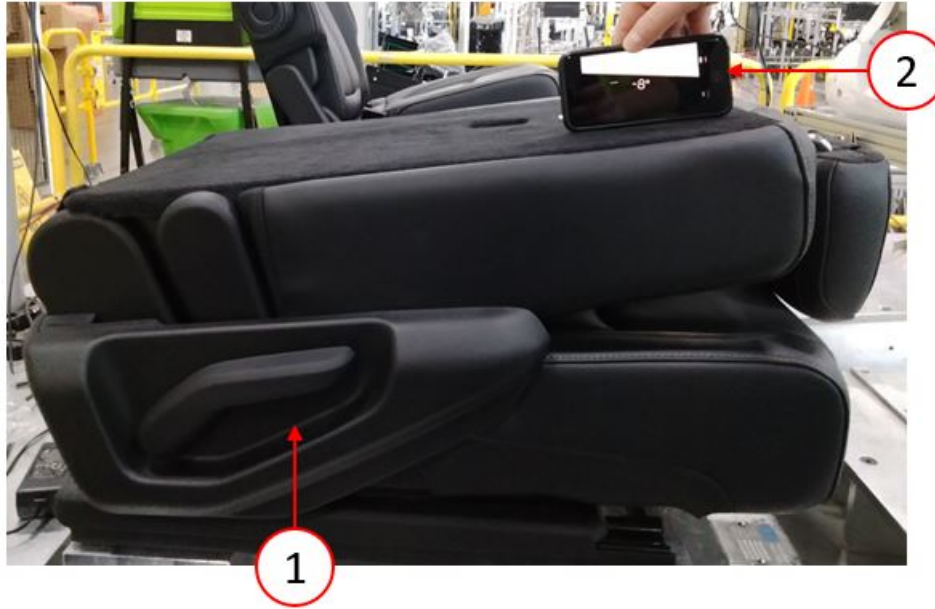
Fig. 1 Seat Folded Flat