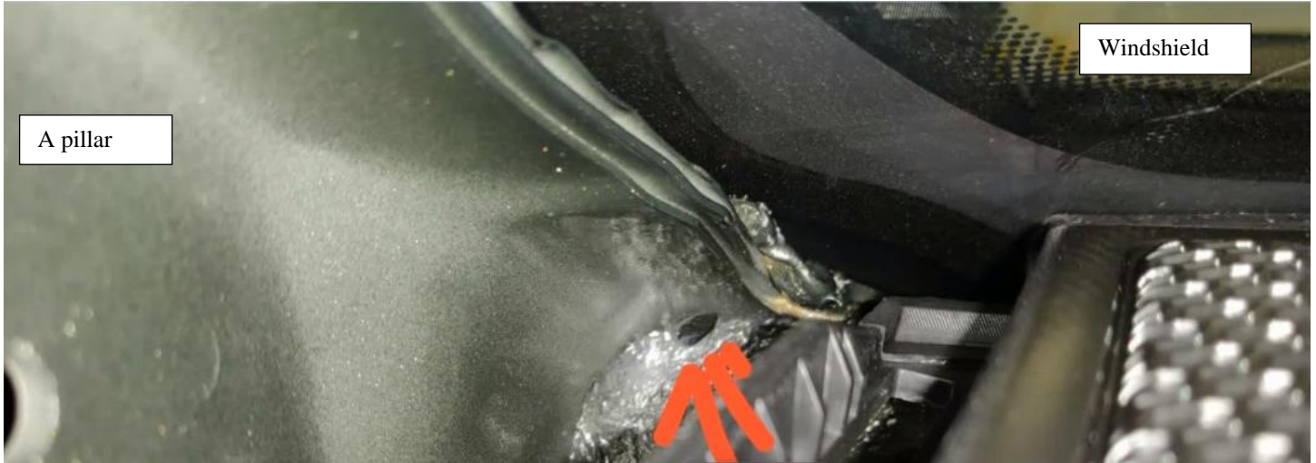
Example of a void in sealer viewed with A Pillar trim removed

This document does not authorize warranty repairs. This communication documents a record of past experiences. STAR Online does not provide any conclusions about what is wrong with the vehicle. Rather, it captures all previous cases known that appear to be similar or related to the vehicle symptom / condition. You are the expert, and you are responsible for deciding on the appropriate course of action.