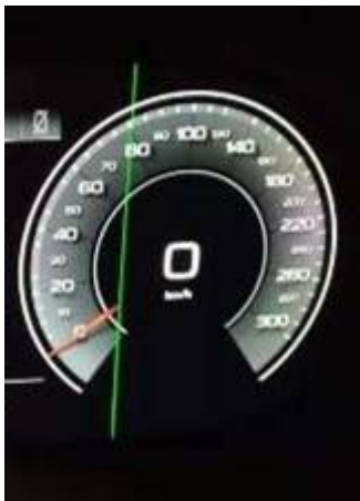
Figure 1. The vertical line through the instrument cluster display.