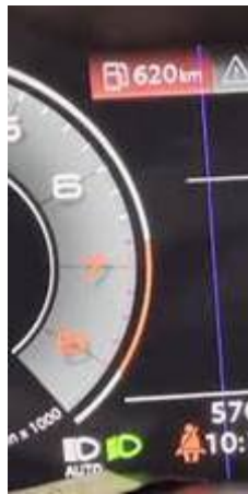
Figure 2. The vertical line through the instrument cluster display.