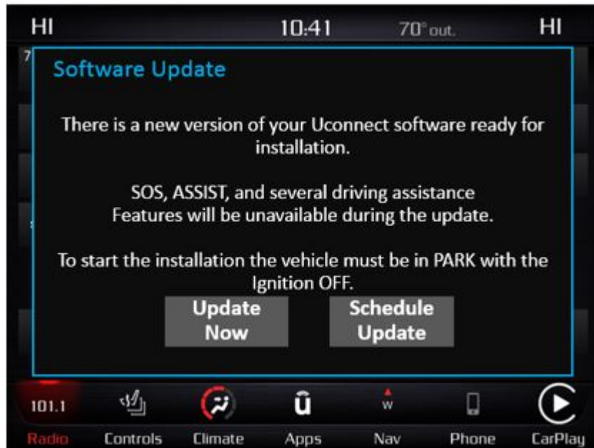
Fig. 1 Software Acceptance Screen

NOTE: If selecting “Schedule Update” the screen below will be displayed. The customer can select the exact time they want the update to begin (Fig. 2) .