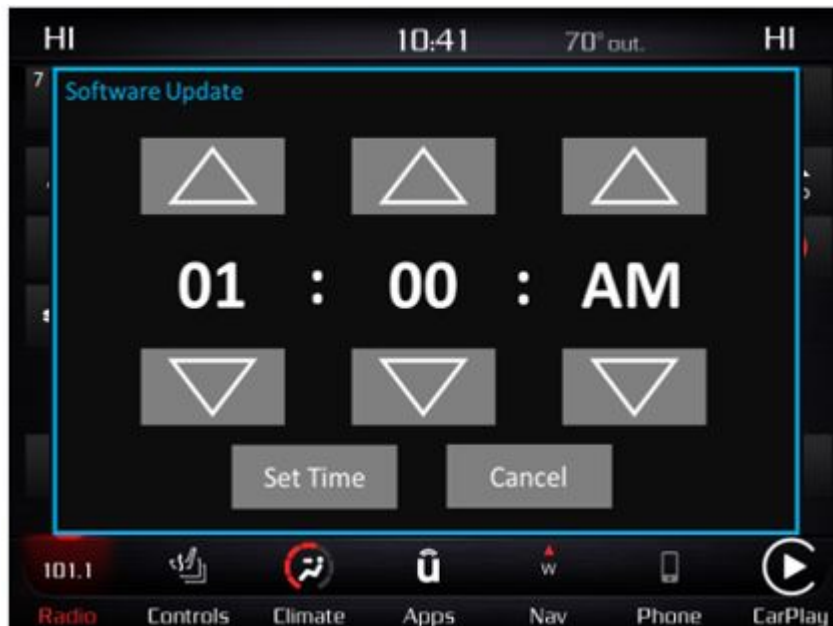
Fig. 2 Schedule Update Screen

NOTE: If selecting “Schedule Update” the screen below will be displayed. The customer can select the exact time they want the update to begin (Fig. 2) .