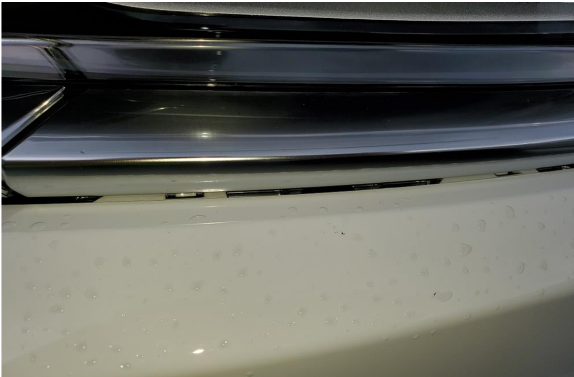
Example of front fascia not fully installed (clips exposed)

Symptom/Vehicle Issue: Front Fascia Gap At Headlamp And Or Clips Visible Under Headlamp