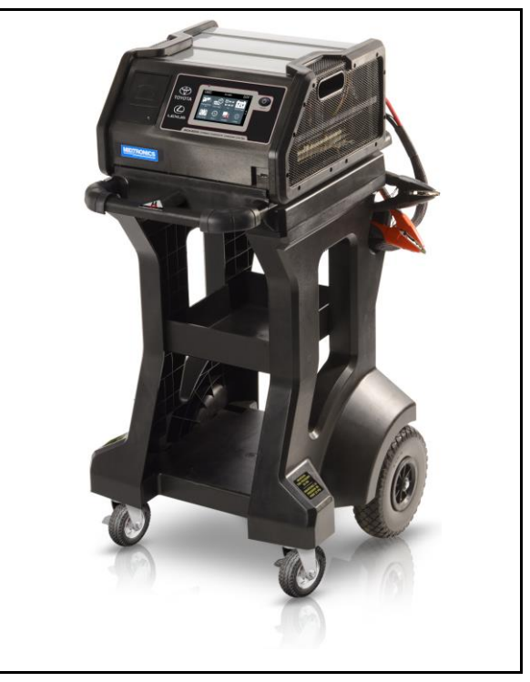
Figure 1. DCA-8000 Battery Diagnostic Tool