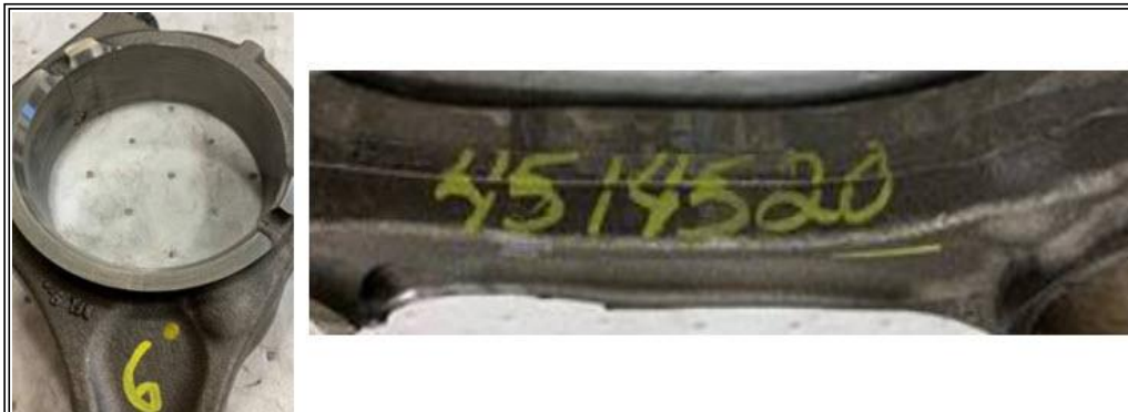
Figure #: Connecting Rod Labeling for Blue Tag Return

NOTE: Every individual connecting rod should be labeled with the ESN and CYL # - See examples below