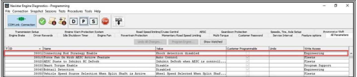
Figure #: Parameter 39001- Connecting Rod Strategy Enable