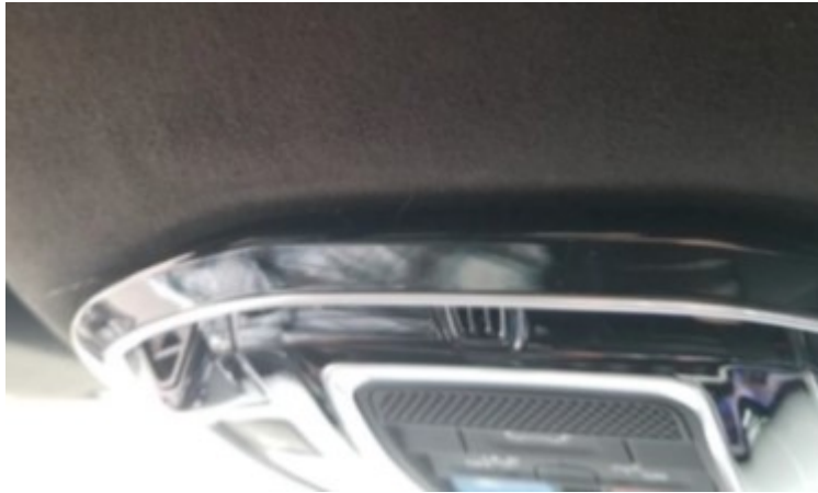
Fig. 1 Overhead Console Gap