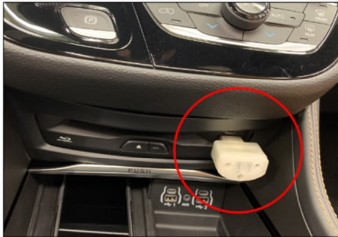
Fig. 1 USB Port On The DVD/Blu-Ray Player