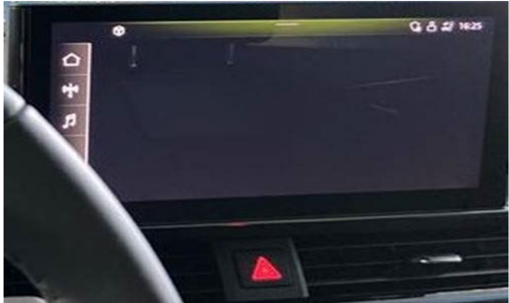
Figure 1: ASI display blank when using wACP.