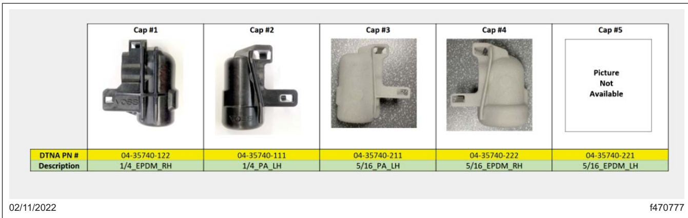
Fig. 6, DEF Connector Reinforcement Cap Kit Parts

See Fig. 6 for a list of DEF connector reinforcement cap part numbers.