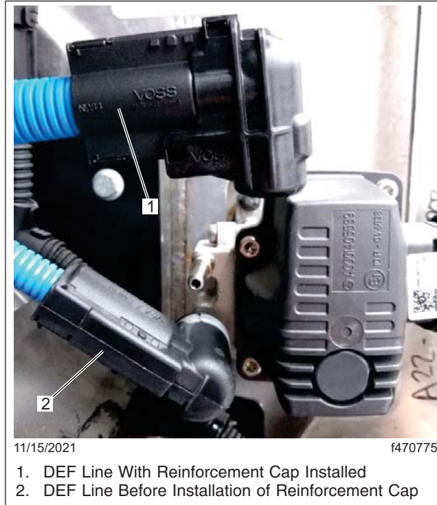
Fig. 2, Reinforcement Cap Installation