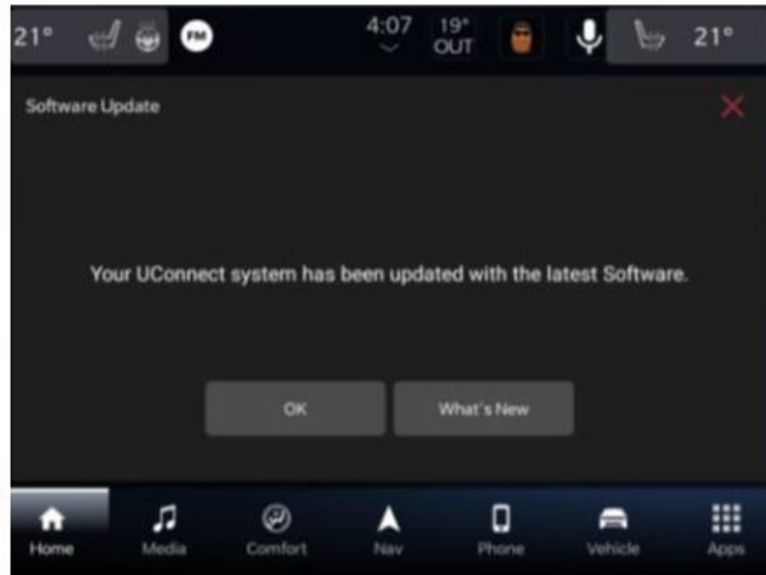
Fig. 2 Software Update Confirmation Screen