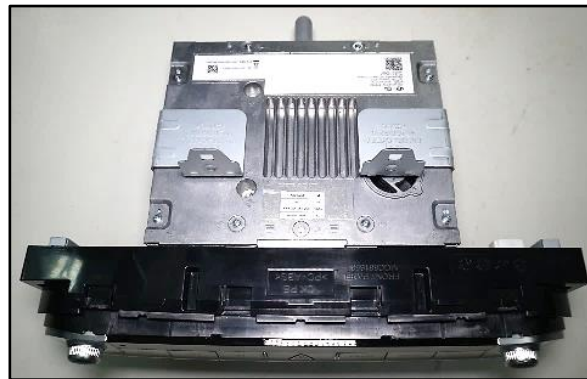
AVN Head Unit

This bulletin provides information to replace the AVN head unit on some 2018-2020MY Stinger (CK) vehicles produced from October 1, 2017 through May 31, 2019, which exhibit intermittent audio dropping or audio sound cutting out concern while the engine is 'ON' or during normal driving operation. Confirm that the concern is present and place an order for the applicable AVN part required. Follow the procedure outlined in this publication to replace the AVN head unit.