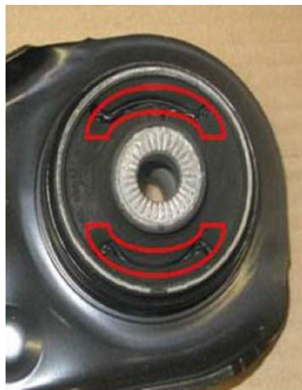
Figure 3. Lithium grease is applied on the red highlighted area only.

The lithium grease must only be applied to the areas shown in red (Figure 3).