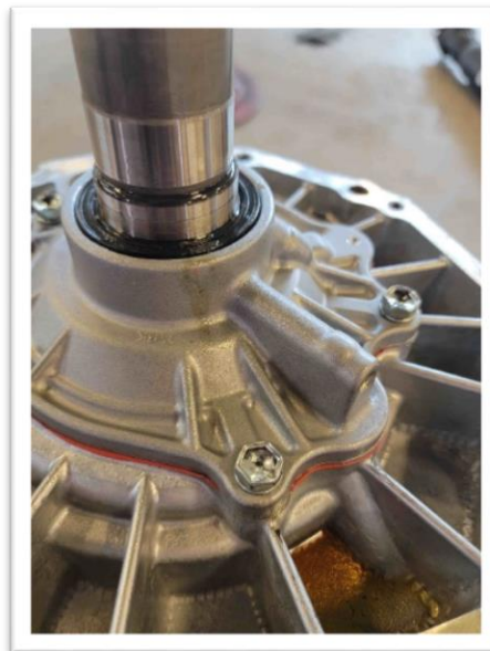
Figure 2 Input Shaft Seal Leak