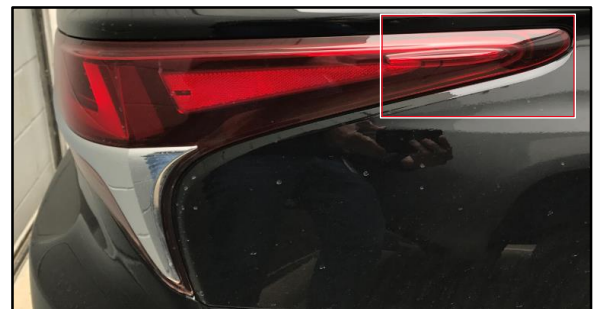
Figure 1. Rear Combination Lamp Movement Location

Figure 1 shows an LS vehicle. RX vehicles exhibit the condition in a similar location.