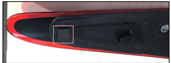
Figure 4. New Forward Pad Installed