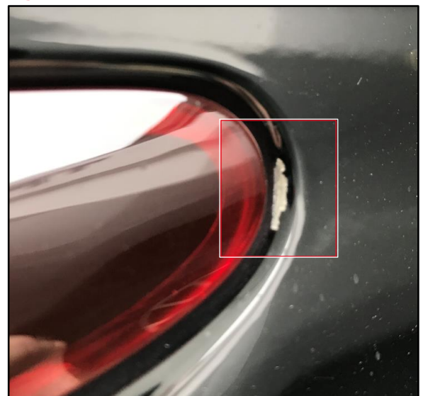
Figure 2. Chipped Paint Condition