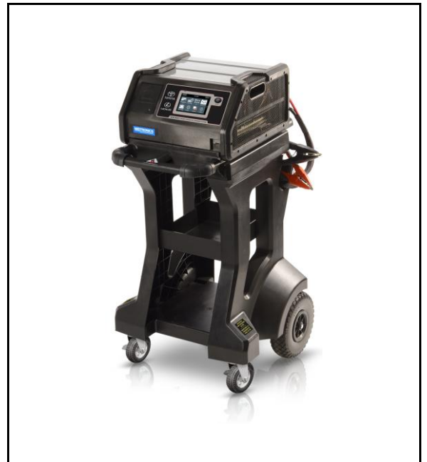
Figure 1. DCA-8000 Battery Diagnostic Tool