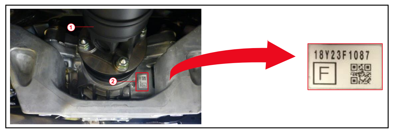
Figure 1. Rear Differential Carrier Assembly Differential Front View

1. Locate the rear differential carrier assembly serial number, as shown in the figure below.