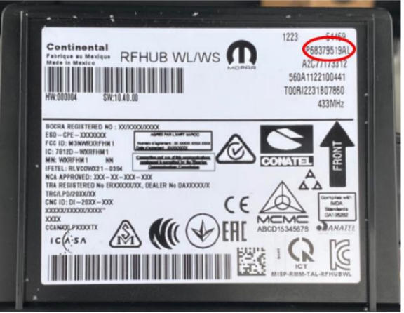
Figure 1 – RFHM Label