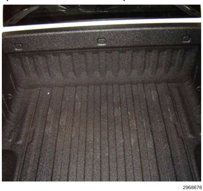
Bed header panel