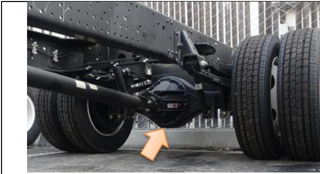
Figure 1 – Code Location