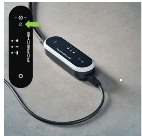
Porsche Mobile Charger Plus