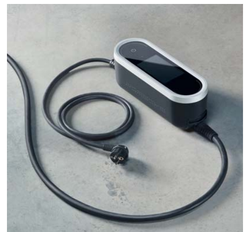
Porsche Mobile Charger Connect