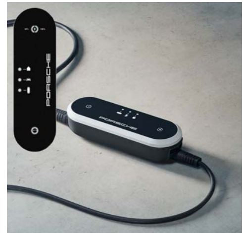
Porsche mobile charger