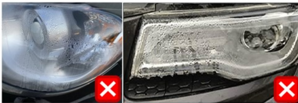
Fig. 3 Condensation/Fogging Not Begun To Clear