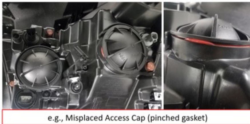
Fig. 6 Misplaced Sealing Components

If no obvious causes are observed, proceed using the failure code for leaks (65) and replace the headlamp. Refer to the detailed service procedures available in DealerCONNECT/Service Library under: Service Info>08 - Electrical / 8L - Lamps and Lighting / Lamps/Lighting - Exterior / Unit, Front Lamp / Removal and Installation.