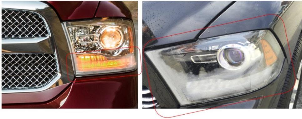
Fig. 1 Fogged Headlamps

A lamp that exhibits condensation/fogging should be evaluated in a service bay environment according to the following steps: