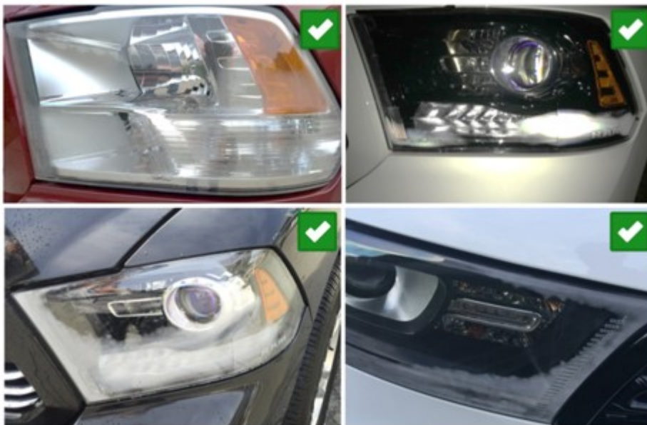
Fig. 2 Condensation/Fogging Begun To Clear

If the condensation/fogging has begun to clear (Fig. 2) from the lamp lens after 20 minutes with the lamps operating, this indicates the lamp sealing has not been breached, and the lamp does not need to be replaced.