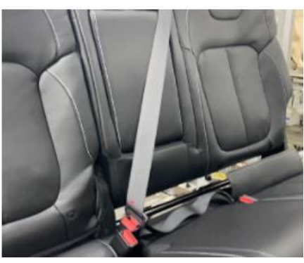
Fig 1. Ok belt condition. Belt lays flat