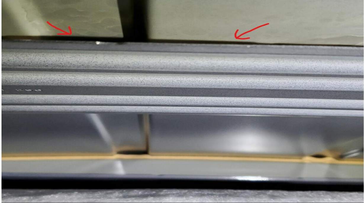
Example of missing anti flutter adhesive.