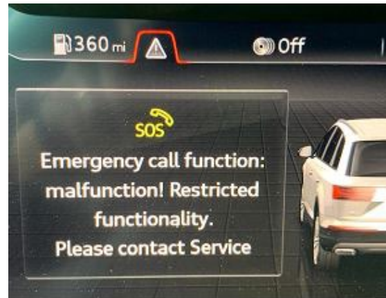
Figure 2. SOS warning in the instrument cluster.