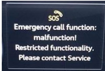
Figure 1. Emergency call malfunction warning.