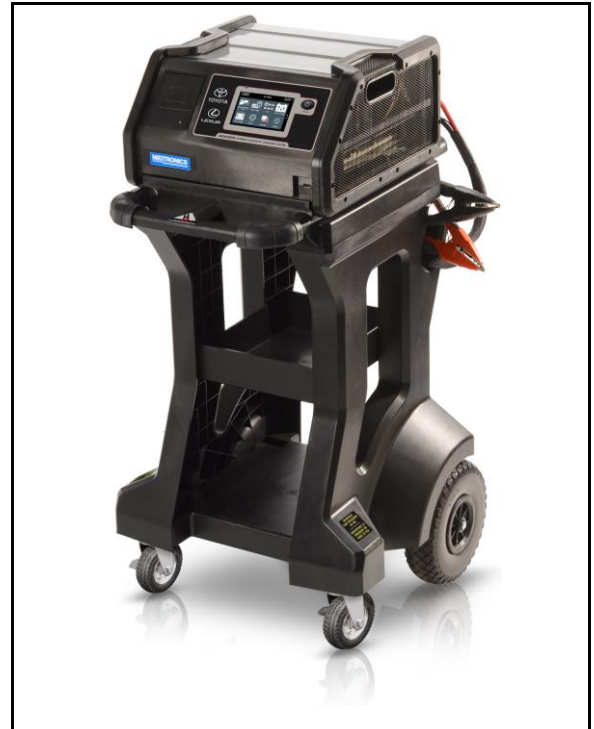
Figure 1. DCA-8000 Battery Diagnostic Tool