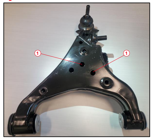
Figure 2. Front Lower Control Arm