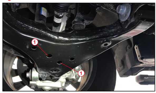
Figure 1. Front Lower Control Arm

6. Test-drive the vehicle at speeds of 30 – 50 mph (50 – 80 km/h) to confirm the condition is no longer present.