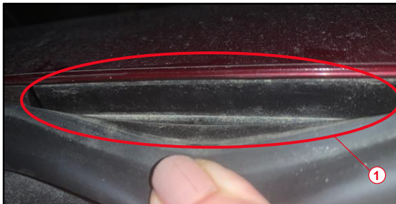
Figure 3. Radiator Grille Bracket Before 11/5/2021

1 Does Not Contain Ribs in the Center Section Directly Above the Emblem