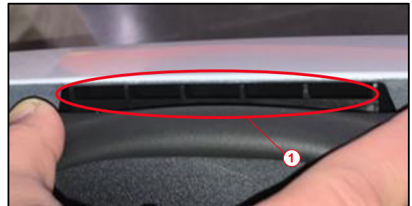
Figure 4. New Radiator Grille Bracket

1 Contains Ribs in the Center Section Directly Above the Emblem