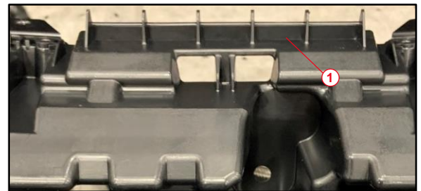
1 Ribs With Open Shape