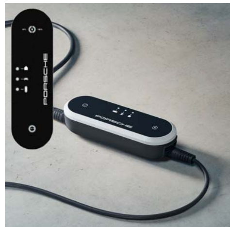
Porsche mobile charger