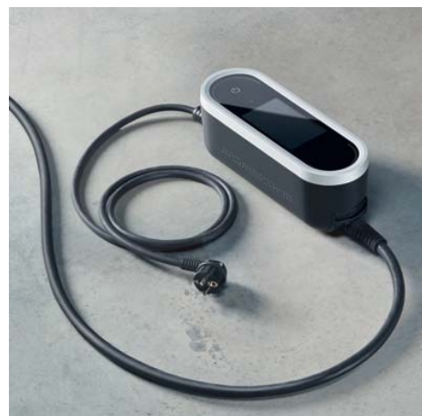
Porsche Mobile Charger Connect