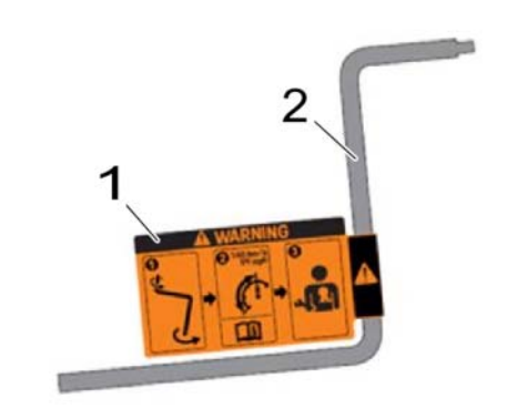
Warning sticker for emergency release handle

This campaign does not need to be entered in the Warranty and Maintenance booklet.