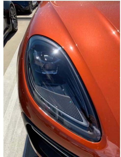
Example graphic, headlight switched off, no contamination visible, therefore no replacement justified

Important Notice: Technical Bulletins issued by Porsche Cars North America, Inc. are intended only for use by professional automotive technicians who have attended Porsche service training courses. They are written to inform those technicians of conditions that may occur on some Porsche vehicles, or to provide information that could assist in the proper servicing of a vehicle. Porsche special tools may be necessary in order to perform certain operations identified in these bulletins. Use of tools and procedures other than those Porsche recommends in these bulletins may be detrimental to the safe operation of your vehicle, and may endanger the people working on it. Properly trained Porsche technicians have the equipment, tools, safety instructions, and know-how to do the job properly and safely. Part numbers listed in these bulletins are for reference only. The work procedures updated electronically in the Porsche PIWIS diagnostic and testing device take precedence and, in the event of a discrepancy, the work procedures in the PIWIS Tester are the ones that must be followed.