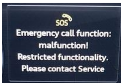
Figure 1. Emergency call malfunction warning.