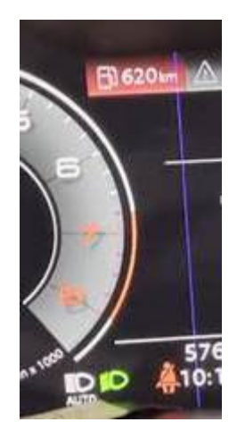
Figure 2 . The vertical line through the instrument cluster display.