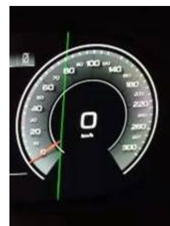
Figure 1. The vertical line through the instrument cluster display.