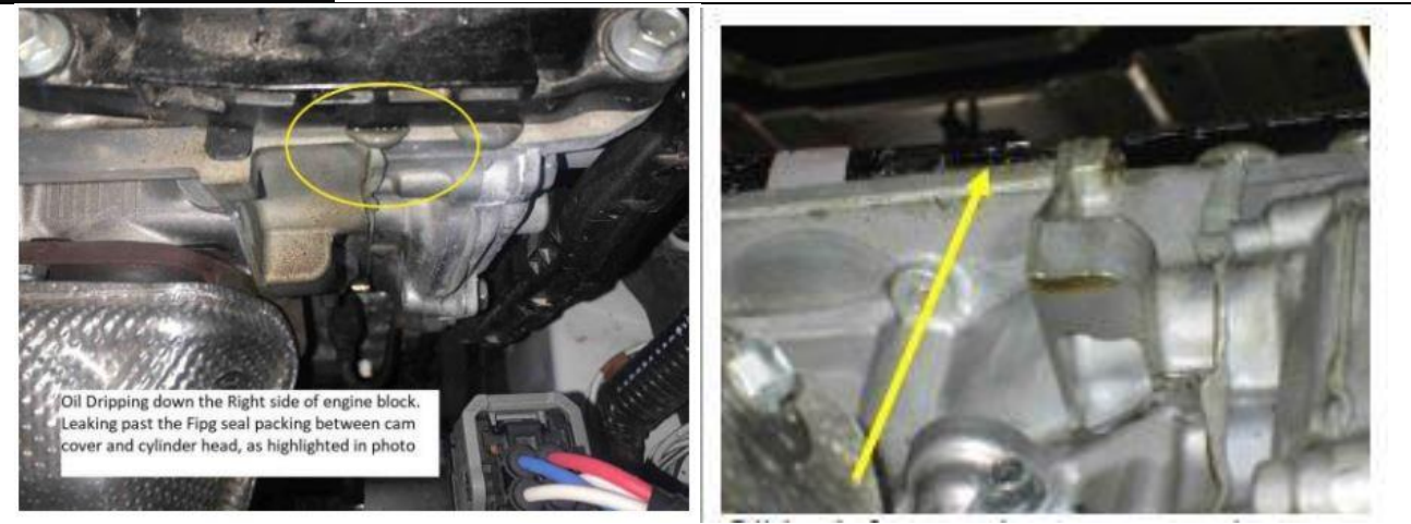
Figure 2. Images of head/valve cover gasket leaks.