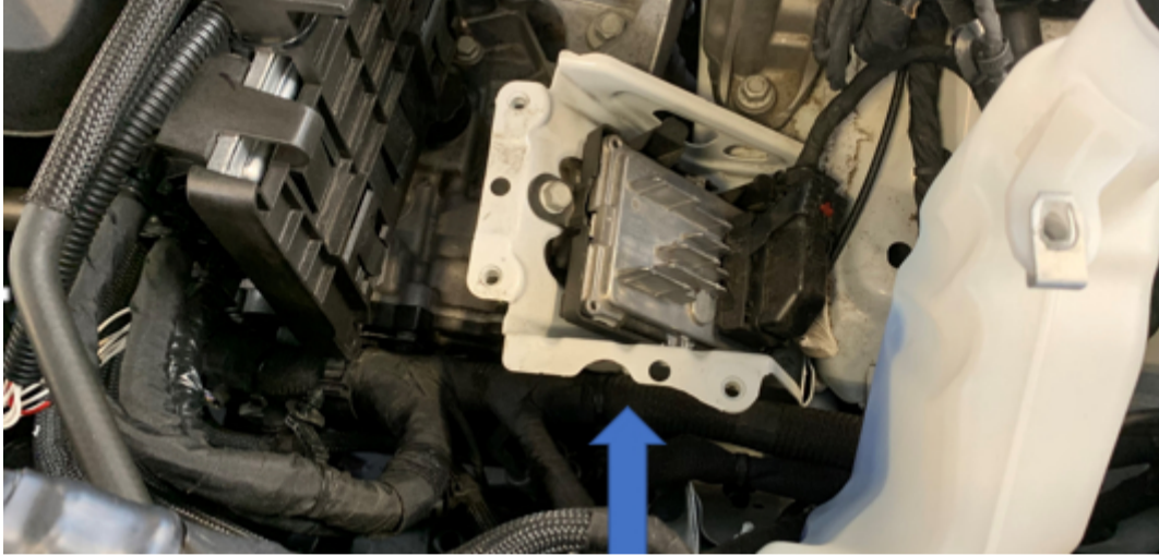
Battery and battery tray are removed to show the area of concern.

It may also be necessary to install a piece of heater hose, conduit or both over the harness to prevent a reoccurrence of the concern.