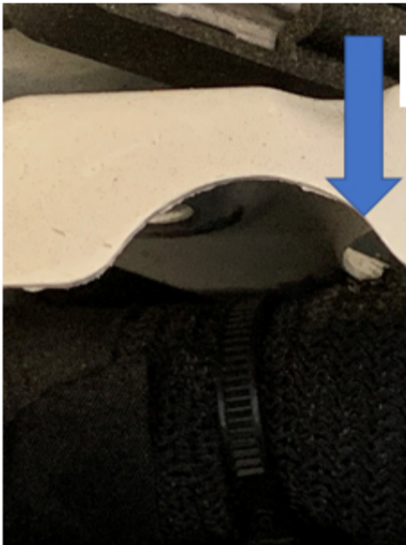
Close up of area where harness may chafe.