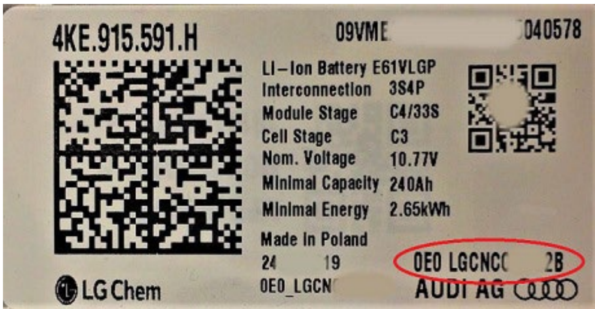
Figure 1. Cell Module identification from an Audi e-tron Quattro.