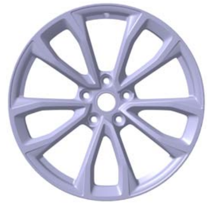
19-inch Macan Design wheel

9 J x 19, ET 21 rear Part No.: 95B.601.025.EH FFF