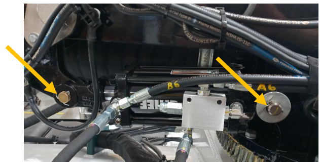
Figure 3: Hair Pin Identification