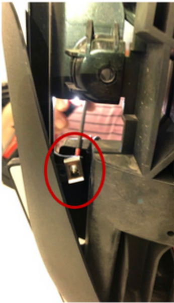
Figure 7. Securing Arm Cover with new Spring Nut and Screw TPG.

6. With the new Arm Cover positioned/aligned with the hole in the Mirror Housing, install the replacement Screw-TPG to secure the Arm Cover as shown in Figure 7.