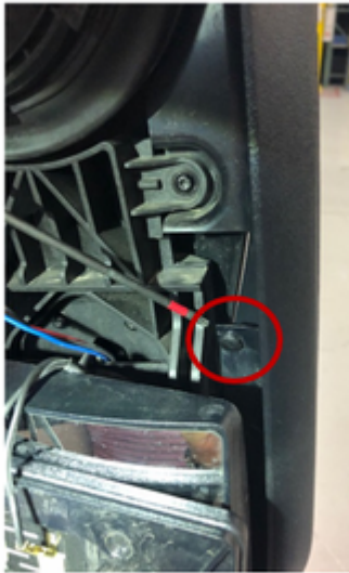
Figure 5. Arm Cover retaining Clip to be replaced.

4. If the Arm Cover is still in place, proceed to remove the Clip holding it in place as shown in Figure 5.