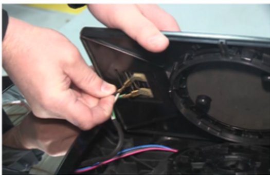
Figure 3. Lifting Flat Glass carrier and disconnecting terminals for Mirror heat.