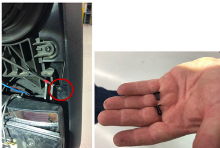
Figure 1: Arm Cover Clip installed-removed

Lower arm covers designs have clips that hold the cover on but over time the clips can fail and allow the covers to become loose or fall off. Clip shown below falls off and cause the Lower Cover to fall off.