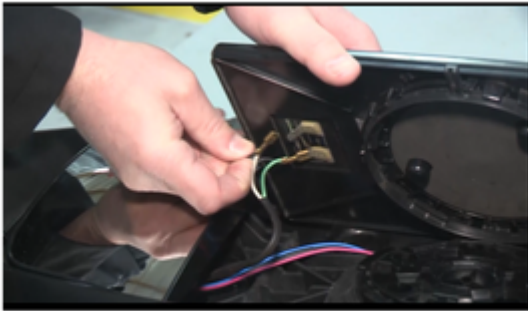
Figure 9. Reconnecting the electrical terminals for the mirror heat to the Flat Glass carrier.

8. Grab the Flat Glass carrier and plug back the electrical terminals for the mirror heat, shown in Figure 9.