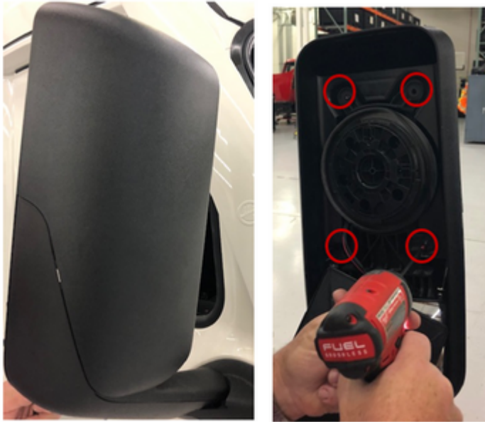
Figure 8. Positioning and securing the Mirror Cover.

8. Grab the Flat Glass carrier and plug back the electrical terminals for the mirror heat, shown in Figure 9.