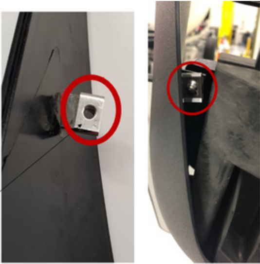
Figure 6. Spring Nut mounted on Arm Cover mounting Tab

6. With the new Arm Cover positioned/aligned with the hole in the Mirror Housing, install the replacement Screw-TPG to secure the Arm Cover as shown in Figure 7.