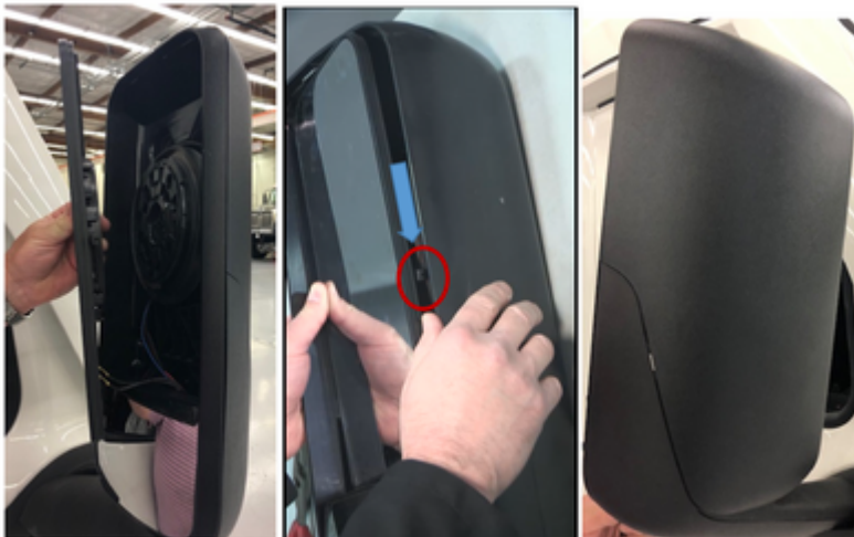
Figure 10. Positioning the Flat Glass carrier and securing it in place pulling down the lever

9. After completing the previous step, mount the Flat Glass carrier, position it, and then pull down the lever to secure the Flat Glass carrier in place to complete the reassembly of the Mirror, see Figure 10.