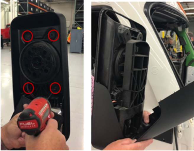
Figure 4. Removing the Cover four mounting screws (arm cover shown in its place)

4. If the Arm Cover is still in place, proceed to remove the Clip holding it in place as shown in Figure 5.