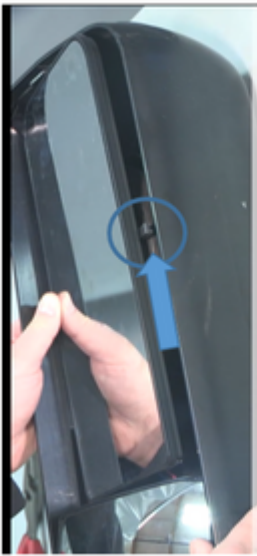
Figure 2. Push down on the left side of the Flat Glass carrier and then pull up the lever.