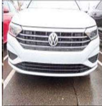
Front grille area