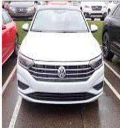
Front bumper cover