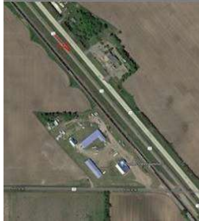
Google satellite view