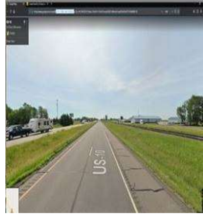
Google street view

The GPS coordinates are contained in the web page address marked in Red