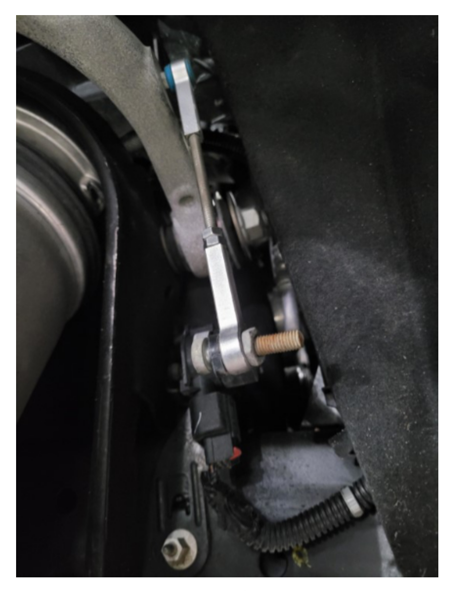
Notice Angle or Rear Axle Drive Shaft due to suspension being lowered.