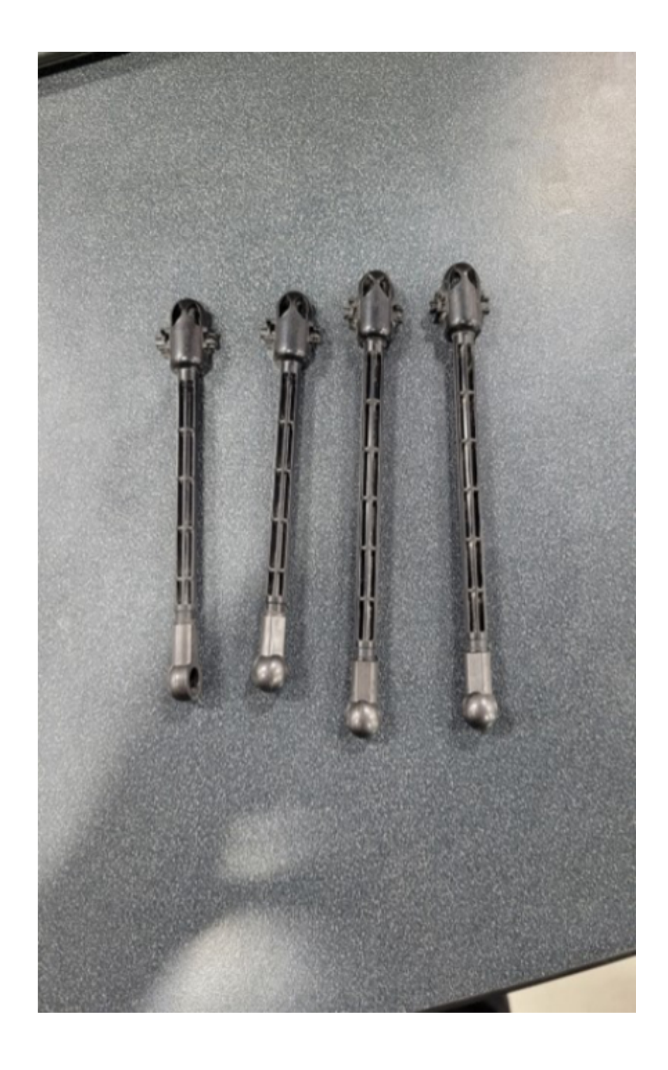
Aftermarket Adjustable suspension height sensor links. As shown below: