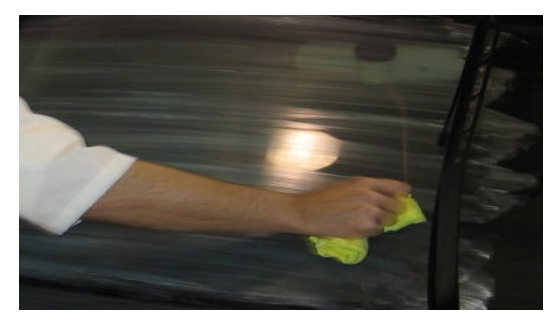
Figure 6. Using horizontal strokes to clean the windshield.

7. Allow drying time until a fine film layer (haze) forms.