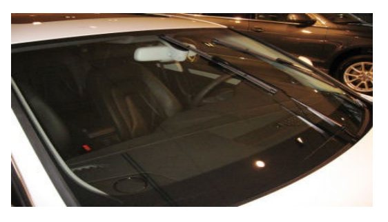
Figure 1. Windshield wipers in the service position.

Using household glass cleaner (such as Windex<sup>®</sup> or 3M<sup>™</sup> Glass Cleaner), clean residue from wiper blades (Figure 2).