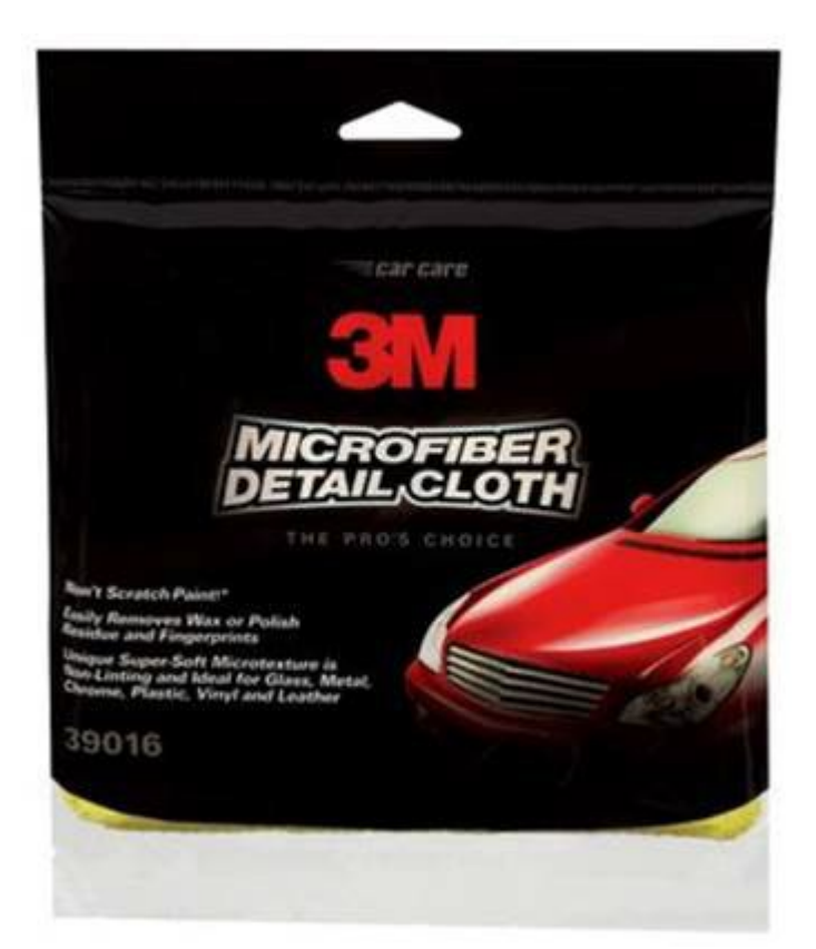
Figure 5. Detailing cloths.

Try to avoid applying the product to the window trim.