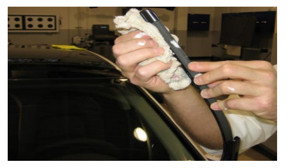
Tip: Do not use Figure 2. Cleaning wiper blades.