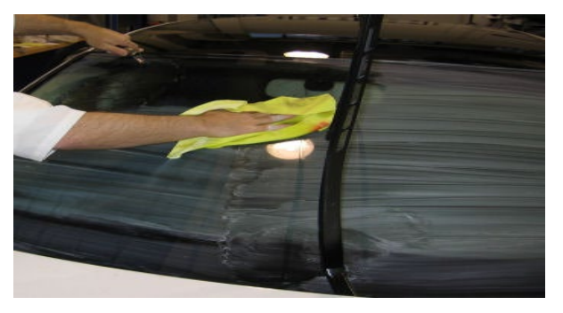
Figure 7. Rinsing the windshield.

Use a garden hose to rinse the windshield. Also, rinse any product that was inadvertently applied to the trim (Figure 7).