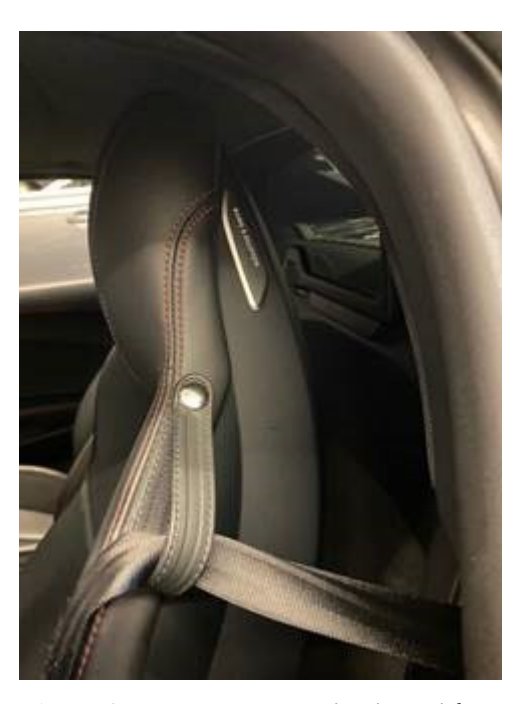
Figure 2. Seat not moving backward far enough.

In some cases, the seats cannot be adjusted backward far enough (Figure 2).