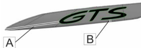
Position of right logo

4 Enter the campaign in the Guarantee and Maintenance booklet.