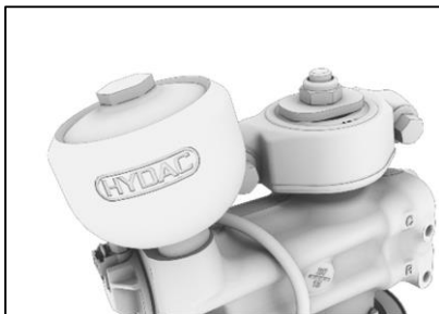
Earlier Membrane Accumulator

McLaren Automotive is pleased to announce that updated suspension accumulators are now available for 720s Coupe and Spider vehicles that were built before May 2021. Post-May 2021, all McLaren 720s Coupe and Spider vehicles were built with the updated metal bellows accumulators. The introduction of metal bellows accumulators for earlier vehicles will bring the benefit of increased longevity in comparison to the earlier membrane accumulators. This bulletin will provide information on the parts required in all circumstances, the Service Information System (SIS) instructions applicable and repair advice.