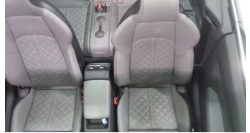
Figure 1. S Sport Seats, PR Code Q4Q in the S5 Cabriolet.