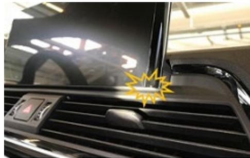
Figure 1. The gap between the MMI screen and the center vent should be 0.5 mm or greater.

Check the gap between the MMI screen and the center vent with a feeler gauge (Figure 1). A gap of 1.0 mm is ideal to avoid any noise-related concerns. If the gap is less than 0.5 mm, perform the following repair.