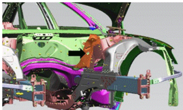
Figure 1. Location of the plenum chamber bulkhead opening.

The plenum chamber bulkhead provides an opening for a vacuum line on all A8 models (Figures 1 and 2). For A8 TFSI e PHEV models this opening is not used. In the production process of an A8 TFSI e PHEV model, a body plug was to be installed to close off this opening. The body plug may not have been installed in this opening on A8 TFSI e PHEV models only.